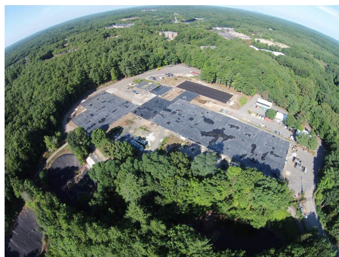
Nuclear Metals building cap completion